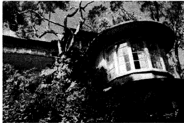
The House Today

BCCT currently has 544 members. Membership subscriptions are our only source of income to finance the Trust's efforts. If you have not joined the Trust, please join now to help us continue our good work.